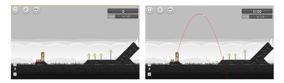
Fig. 2. The game scene before (left) and after (right) performing the shot indicated by the red line in the figure on the right. The MBRs of all objects in both scenes are marked. The change in score after performing the shot is shown on the top right of the figure on the right.

The case extracted from this scenario will contain the original scene, the performed shot and the achieved score, which we represent as follows: